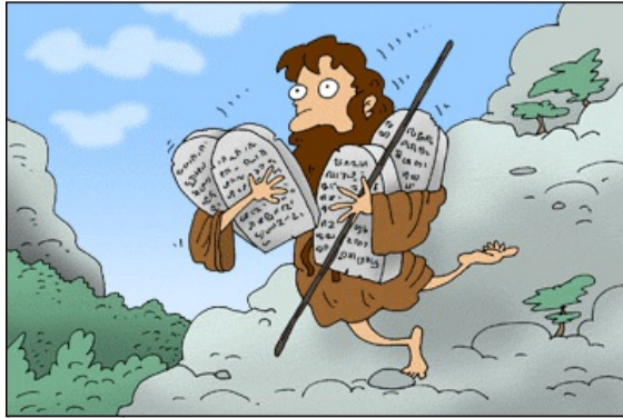
(See Exodus 34) 02-13-2012 MOSES RETURNS DOWN THE MOUNTAIN WITH THE TWENTY COMMANDMENTS