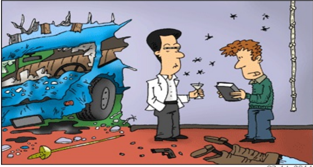
WELL THAT EXPLAINS IT ... YOU'VE BEEN STUDYING FROM THE KING JAMES BOND VERSION